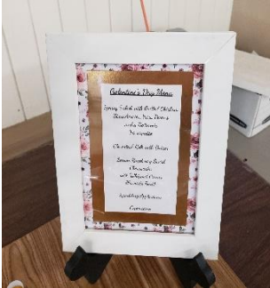
Menu Planning All Entries