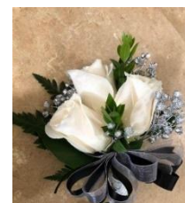
Floriculture Corsage and Boutonniere

If you have any questions, please call (408)494-3103 or Email.