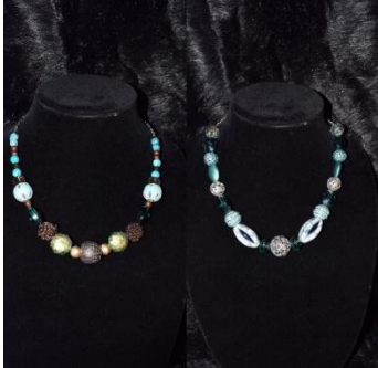
Arts & Crafts Jewelry