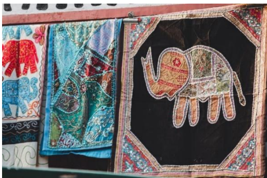
Sewing & Quilting Hand Quilted