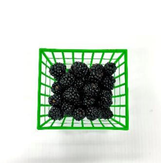
Agriculture-Horticulture Fruits & Nuts