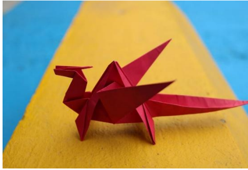
Arts & Crafts Paper Crafts