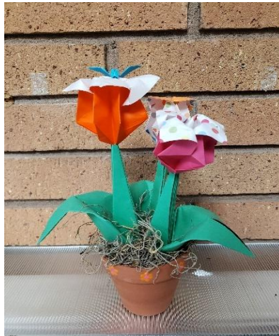
Arts & Crafts Paper Crafts