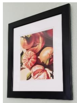
Graphic & Two – Dimensional Artistic Artistic