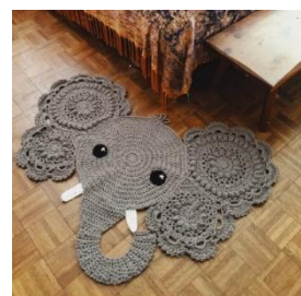
Needle & Fiber Arts Weaving, Hooking, Basketry