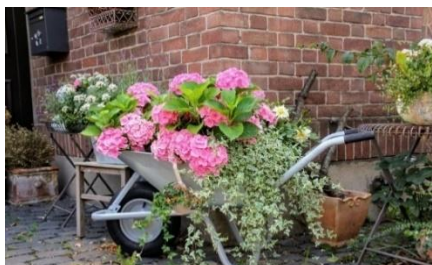
Floriculture Wheelbarrow Garden