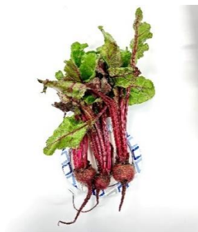
Agriculture-Horticulture Root Crops