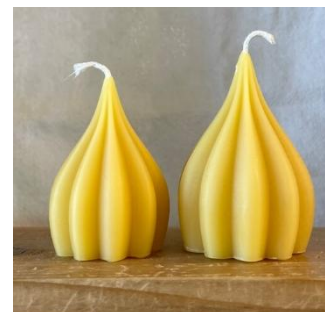
Honey Candles – Poured Candles

If you have any questions, please call (408)494-3103 or Email.