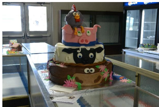
Decorated Foods Decorated Cake