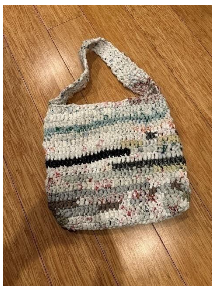
Recycle! Repurpose! Recycle!