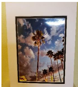
Photography Nature, Floral, Botany