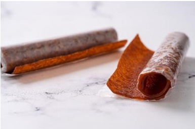
Preserved Foods Fruit Leather