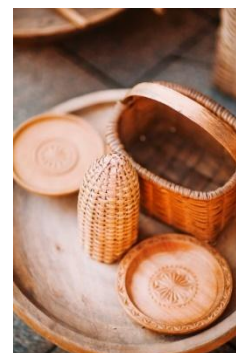
Needle & Fiber Arts Weaving, Hooking, Basketry