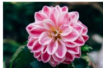
Floriculture Cut Flowers