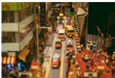
LEGOS Realism Build