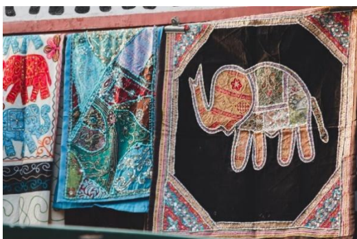
Sewing & Quilting Hand Quilted