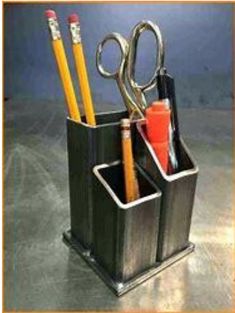
Metalwork Functional Items