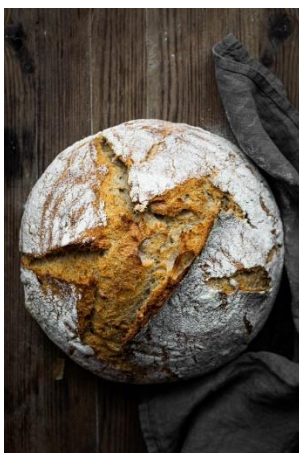
Baked Goods & Confections Bread

If you have any questions, please call (408)494-3103 or Email.