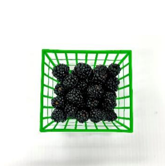
Agriculture-Horticulture Fruits & Nuts