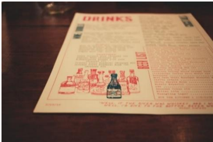
Menu Planning All Entries