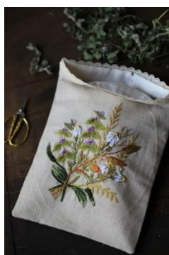
Needle & Fiber Arts Embroidery, Cross Stitch, Crewel, Needlepoint