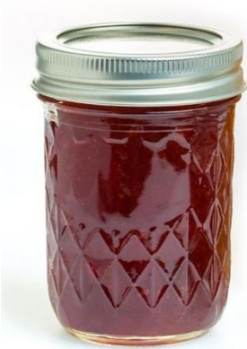
Preserved Foods Jams