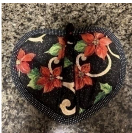
Sewing & Quilting Household