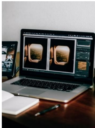
Technology & Computer Science Photo Editing