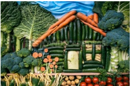
Veggie-Art Any Other