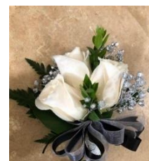
Floriculture Corsage and Boutonniere

If you have any questions, please call (408)494-3103 or Email.