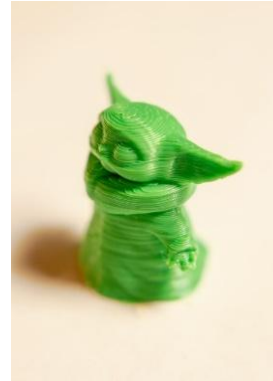
Technology & Computer Science 3-D Printing