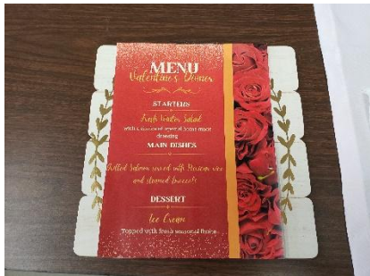
Menu Planning All Entries