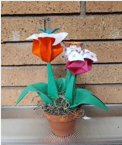
Arts & Crafts Paper Crafts