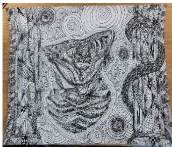
Graphic & Two – Dimensional Artistic Artistic