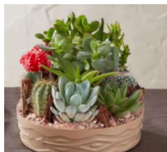
Floriculture Cacti/Succulents Dish Garden