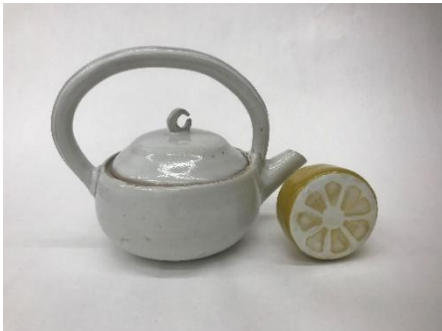
Arts & Crafts Ceramics