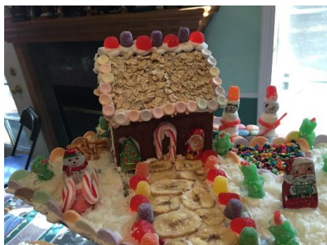
Decorated Foods Gingerbread House