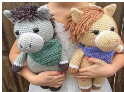
Needle & Fiber Arts Crochet