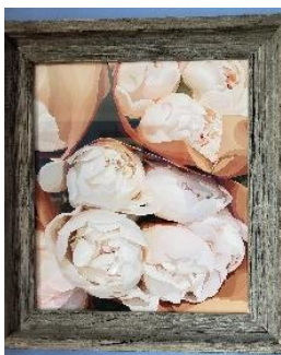
Graphic & Two – Dimensional Artistic Artistic