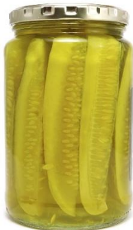
Preserved Foods Pickled Items