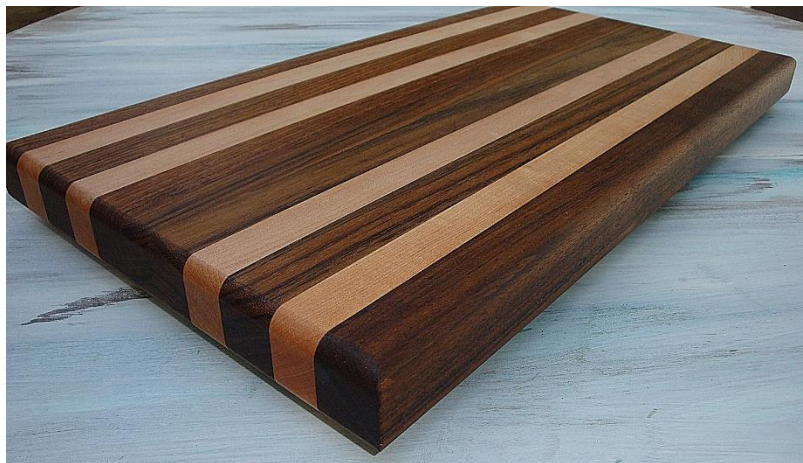
Woodworking Functional Items