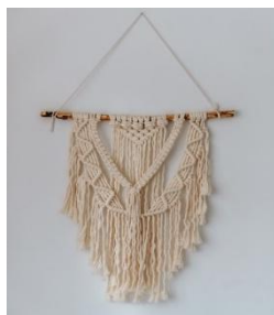
Needle & Fiber Arts Weaving, Hooking, Basketry