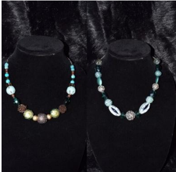
Arts & Crafts Jewelry