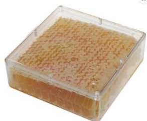
Honey Comb Honey - Cut