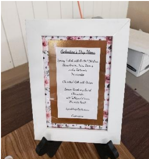
Menu Planning All Entries