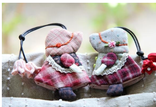
Sewing & Quilting Quilted non-wearable