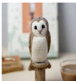
Needle & Fiber Arts Felting, Needle Felting, Wet Felting