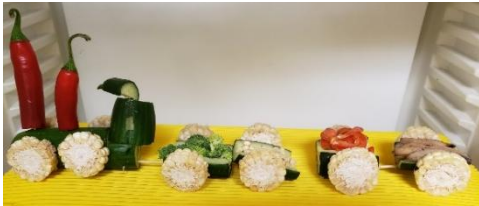
Veggie-Art Any Other