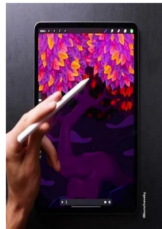
Technology & Computer Science Digital Animation