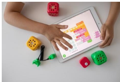
Technology & Computer Science Programming