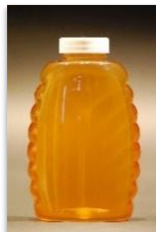
Honey Medium Extracted Honey