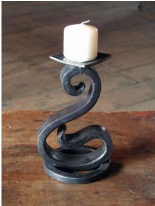
Metalwork Functional Items