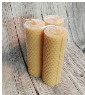
Honey Candles – Poured Candles