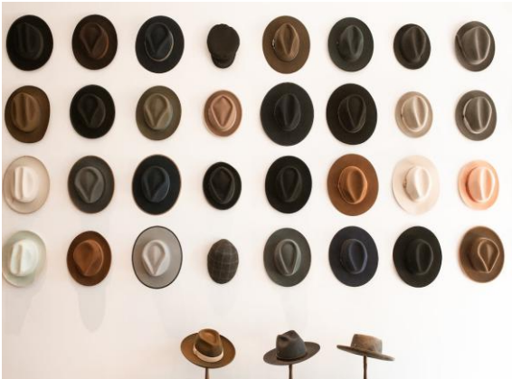
COLLECTIONS All Entries