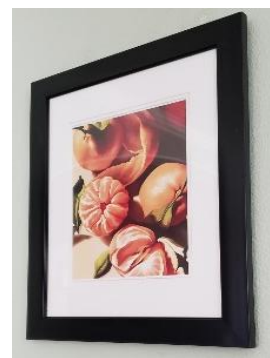
Graphic & Two – Dimensional Artistic Artistic