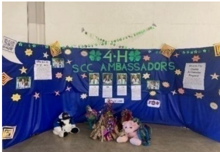
Feature Booth Feature Booth