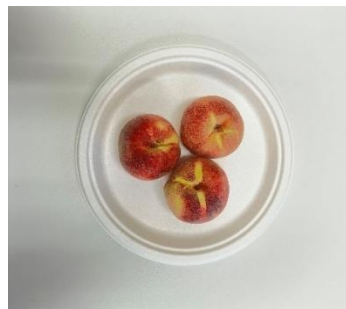
Agriculture-Horticulture Fruits & Nuts