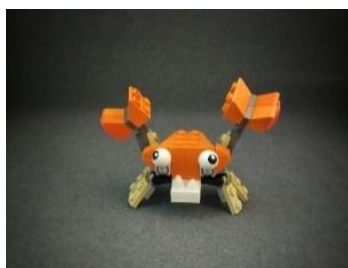
LEGOS Original Creative Build