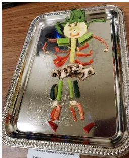
Veggie-Art Any Other