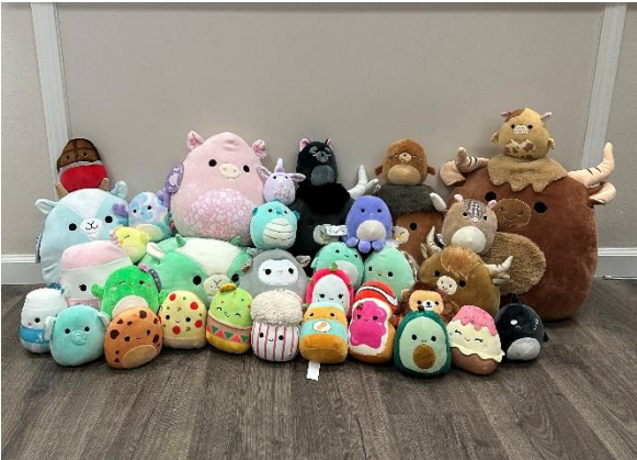
COLLECTIONS All Entries