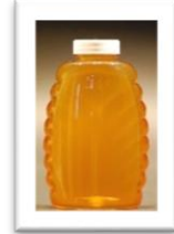
This is a Queen line Jar