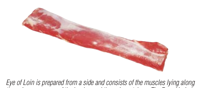
Eye of Loin is prepared from a side and consists of the muscles lying along the spinous process of the lumbar and thoracic vertebrae. The Eye of Loin is the portion from the 4th thoracic vertebrae up to the lumbar sacral junction.