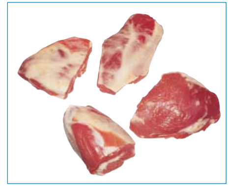
LEG CUTS - H.A.M. Code: 5065