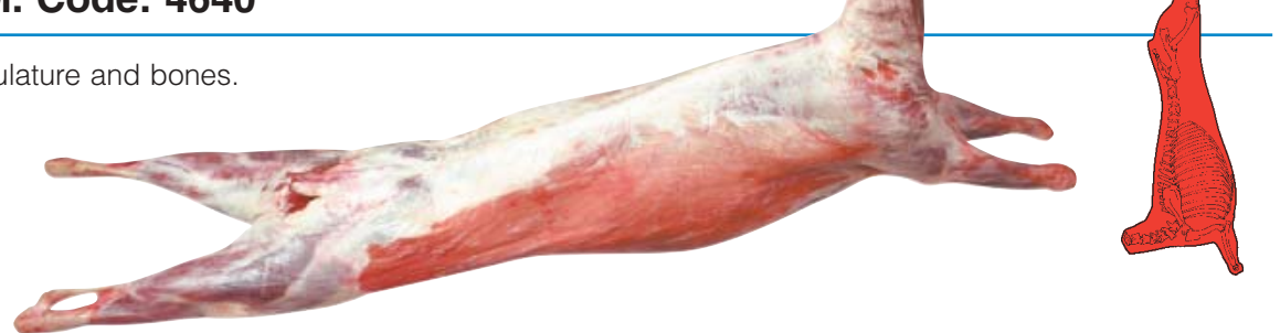
Note: Goatmeat primal cuts and H.A.M. code numbers are the same reference as Lamb / Sheepmeat primal cuts and descriptions.