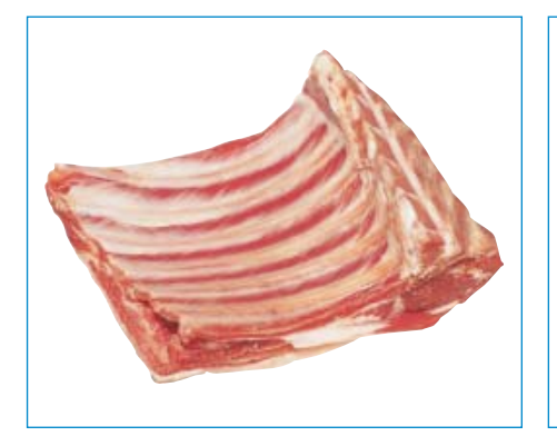
RACK - H.A.M. Code: 4931