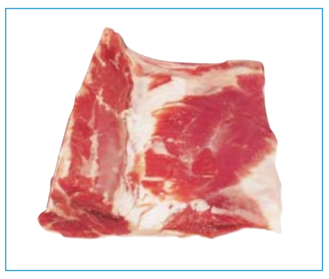
SHORTLOIN - H.A.M. Code: 4880