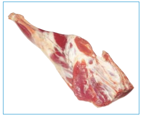
LEG - CHUMP ON - H.A.M. Code: 4800